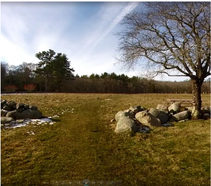
TRAIL SECTION AT OPEN FIELD AREA.