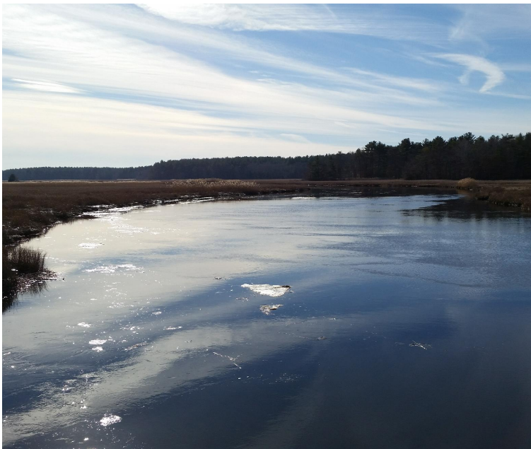
VIEW OF NORTH RIVER.