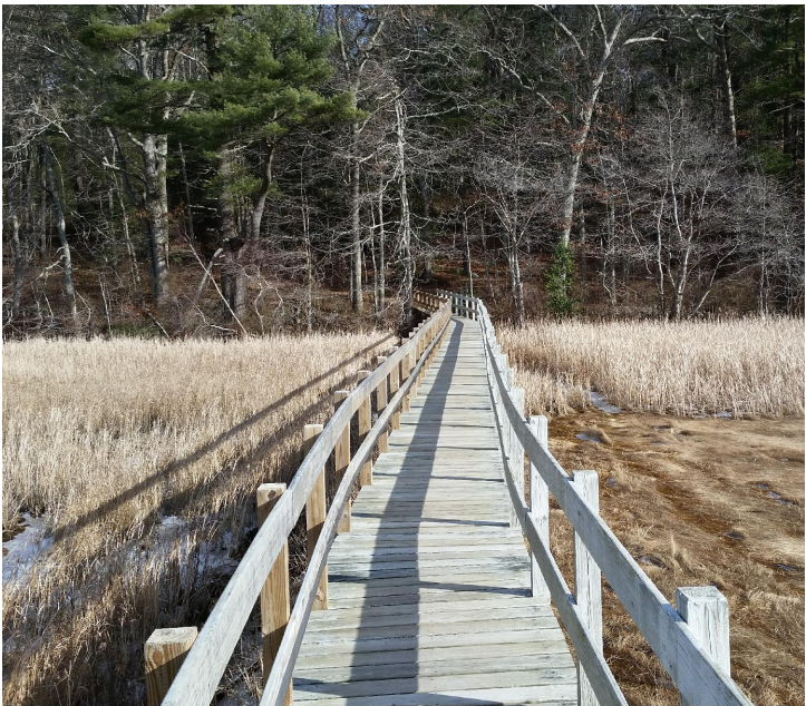
PIER AT NORTH RIVER TRAIL TERMINUS, LOOKING EAST TOWARDS CONSERVATION LANDS.