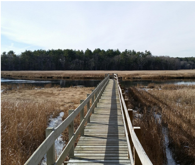
DOCK OVERLOOKING THE NORTH RIVER, LOOKING WEST.