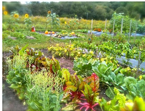
Community Gardens at Mounces Meadow