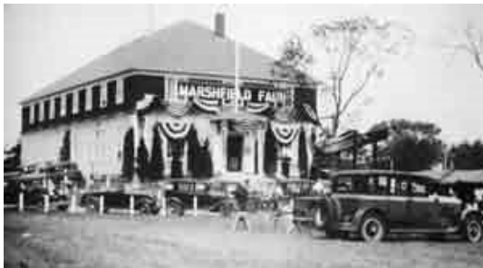
Old photo of Agricultural Hall during the Fair

Daniel Webster organized cattle shows on the Training Green and following his lead, the first agricultural fair was held in 1862 by the South Marshfield Farmers' Club. Over time this group developed into the Marshfield Agricultural and Horticultural Society, a private non-profit society established in 1867. This society organized the annual Marshfield Fair, one of the oldest agricultural fairs in the country.