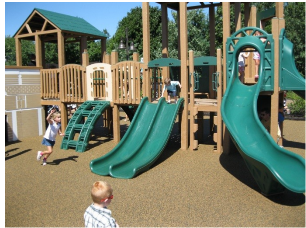
Fig 4. Marshfield Kids at Play Playground