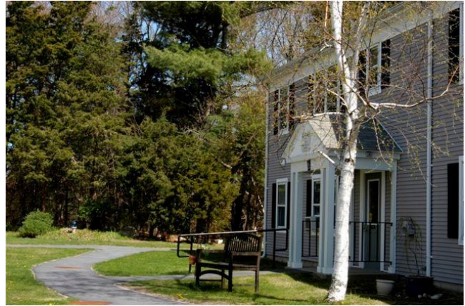
Fig 2: Winslow Village

In other words, Marshfield must annually either spend or "bank" not less than 10% of the current CPA revenues for acquisition, creation, preservation, support, rehabilitation, or restoration of community housing.