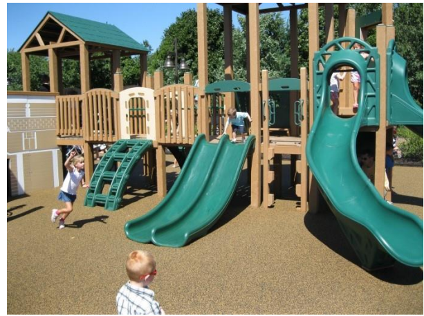
Fig 4. Marshfield Kids at Play Playground