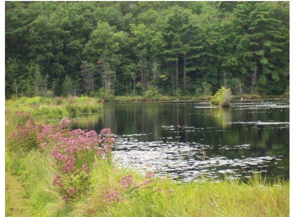
Fig 1: Ellis Woodland

In other words, Marshfield must annually either spend or "bank" not less than 10% of the current CPA revenues for acquisition, creation, preservation, rehabilitation, or restoration of open space.