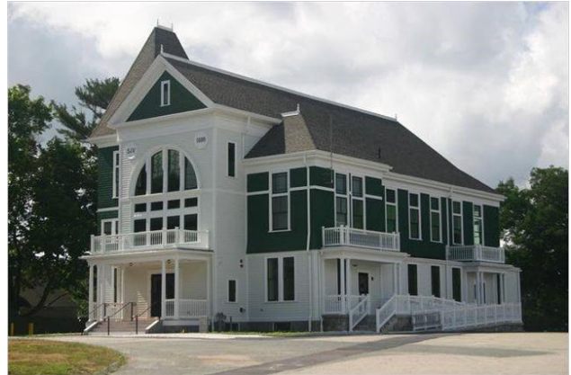
Fig 3: Seth Ventress Building

The CPA requires that Marshfield "...shall spend, or set aside for later spending, not less than 10 per cent of the annual revenues in the Community Preservation Fund for historic resources..." In other words, Marshfield must annually either spend or "bank" not less than 10% of the current CPA revenues for acquisition, preservation, rehabilitation, or restoration of historic sites and resources.