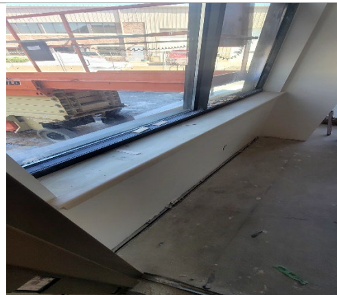
Windowsill millwork in muster room