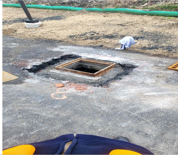
A catch basin top being installed