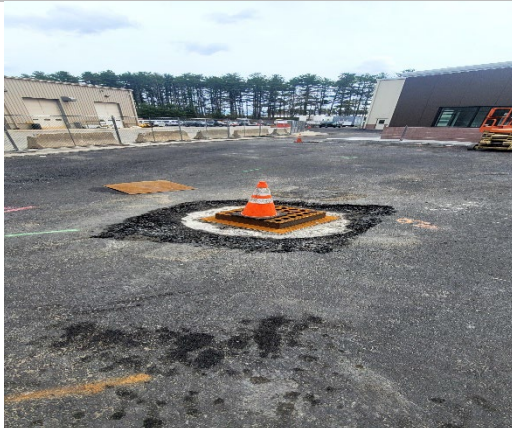
Another catch basin installed (near leaching field)