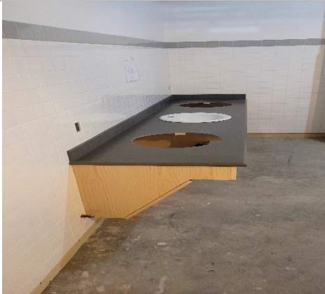
Vanity in the men's bathroom