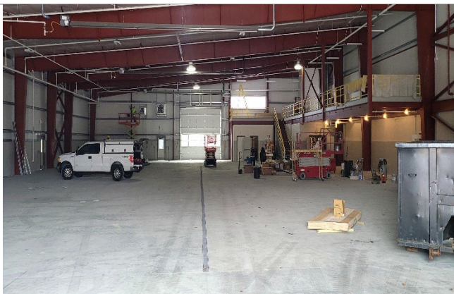
View of vehicle storage