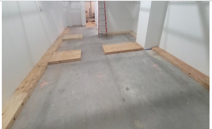
Mens room platform for lockers