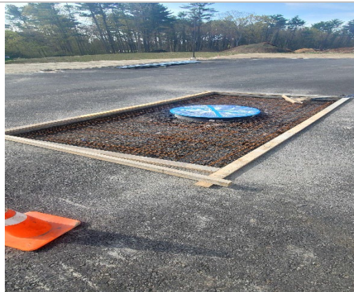
Concrete pad being prepped around the oil/water separator