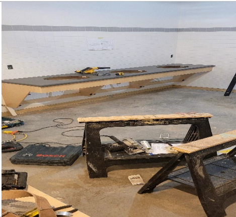
One of the vanities in the bathroom