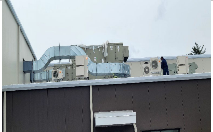
Duct work connected to HRV-1 on admin roof.