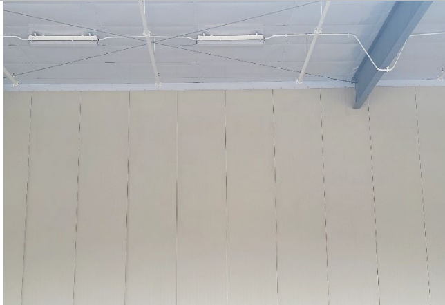
Seams at canopy wall being filled