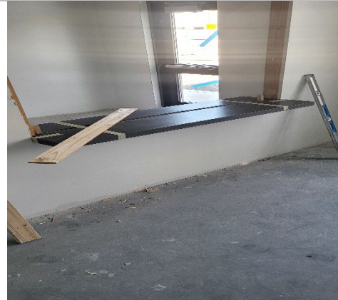
Service window at main entrance in dispatch room