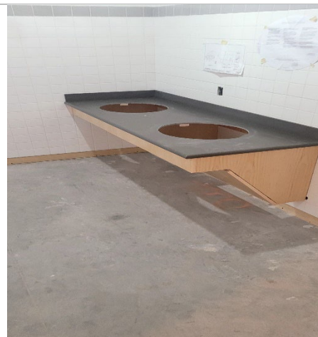
Vanity in the women's bathroom