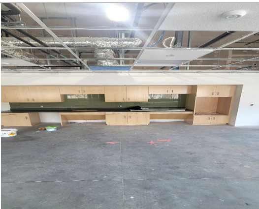
Wide shot of cabinets in muster room