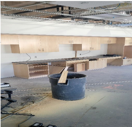
Alt. view of millwork in muster room