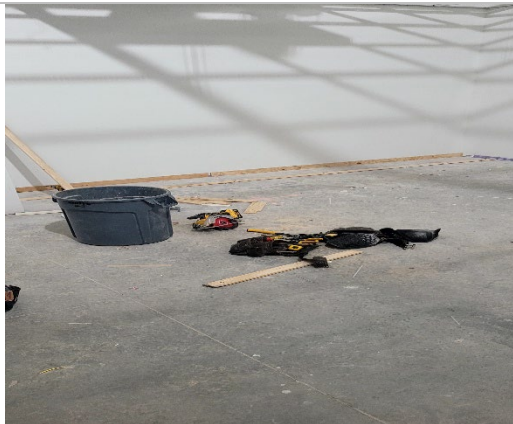
Alt. view of bathrooms and platforms