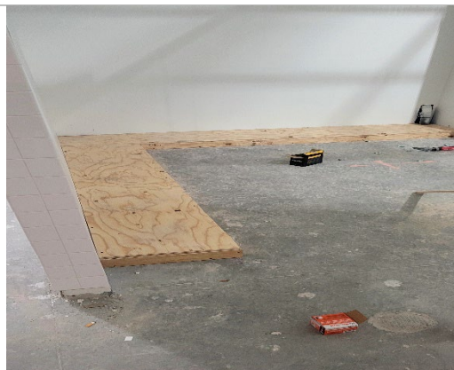
Platforms for the lockers in the bathrooms