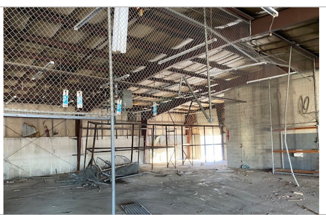
Interior Demolition at Vehicle Maintenance Area