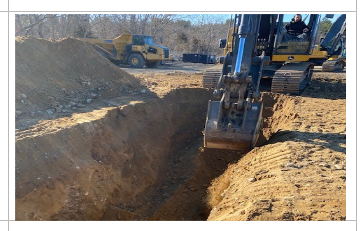
Test Pit excavated at Hydraulic Lift Area

Removal and Sampling of Hydraulic Piston at Lift Area