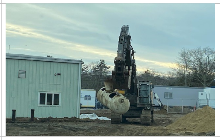
Removal of Holding Tank