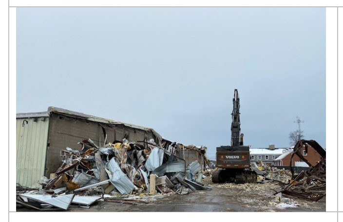
Demolition of Vehicle Maintenance Area