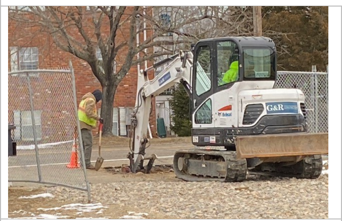
Excavation for Cutting and Capping of Sewer Main