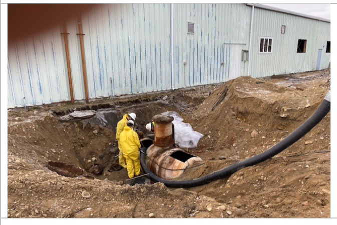
Vacuuming of 1,000 gallon Holding Tank prior to removal and demolition