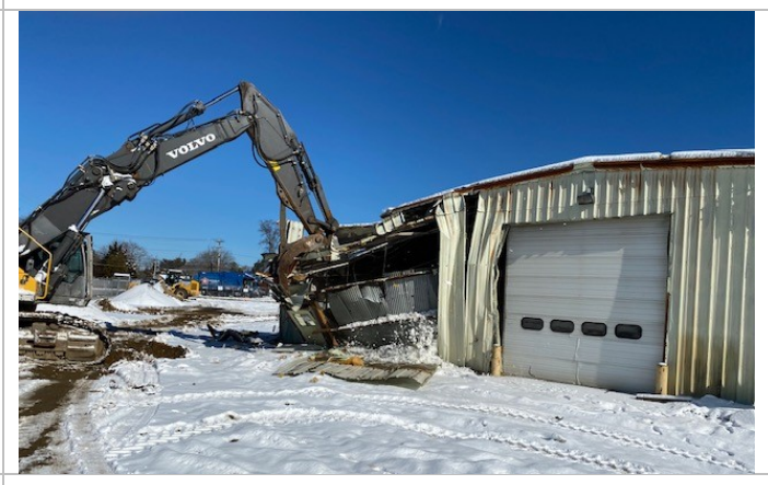
Building Demolition begins at Northwest Corner of Building