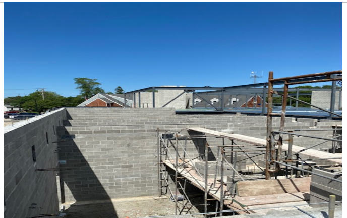
Overhead view looking into Processing Area