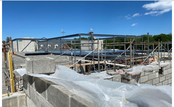
View of Steel Framing at Second Floor