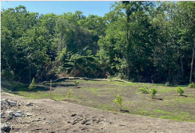
Wetlands Restoration Phase 1 Completed