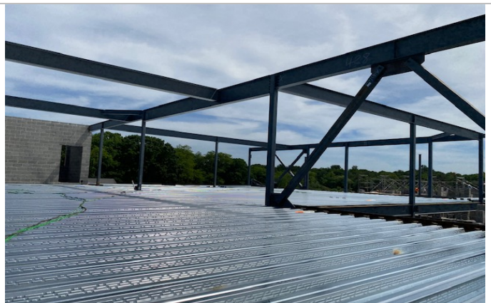
Metal Decking installed at Second Floor by Stairway 11 and Elevator