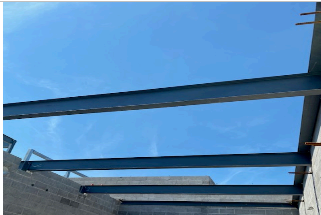
Structural Beams installed at Sallyport