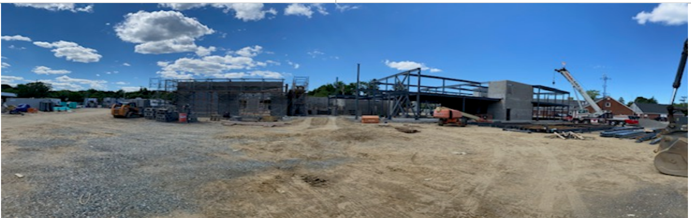
Panomramic View of Future Marshfield Police Station