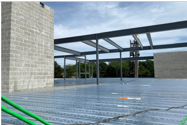
Metal Decking installed at Second Floor by Stairway 12