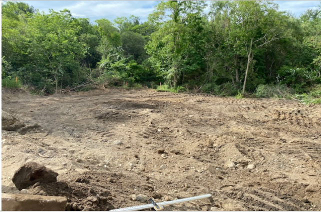
Area of Wetlands Restoration prior to sitework