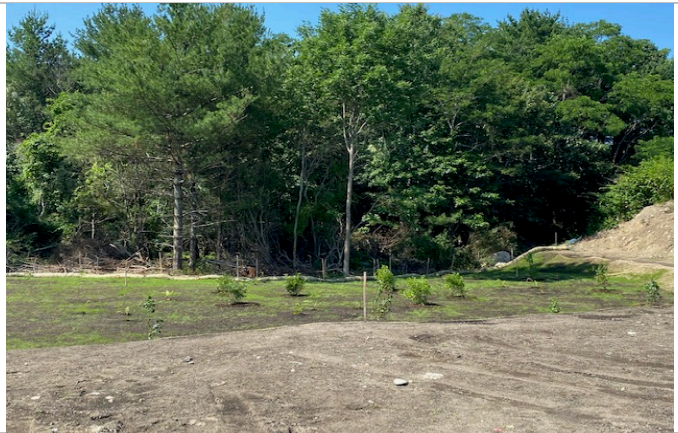
Wetlands Restoration Phase 1 Completed