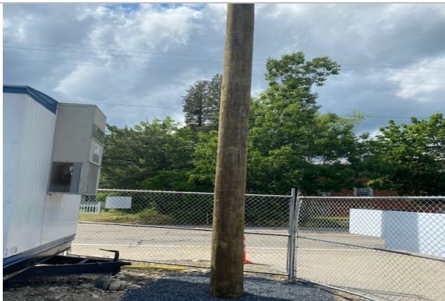
New Utility Pole installed for Primary Service