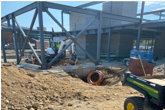
Trenching and Installation of 2" Domestic Water