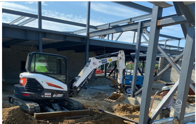
Trenching and Installation of Underslab Plumbing