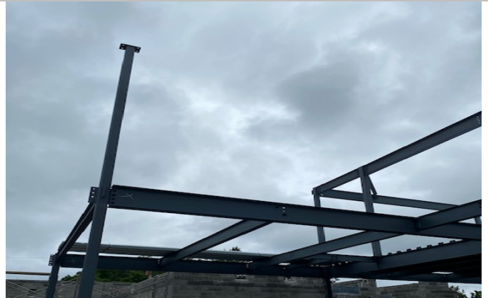
Column installed at Second Floor of Column Line 10