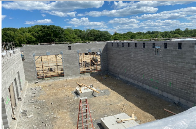
Overhead view looking into Sallyport