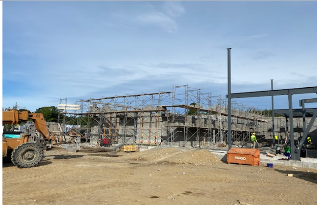
Scaffolding surrounding Sallyport in preparation of Grouting