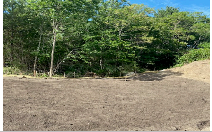
Wetlands Restoration after approved soils installed and graded