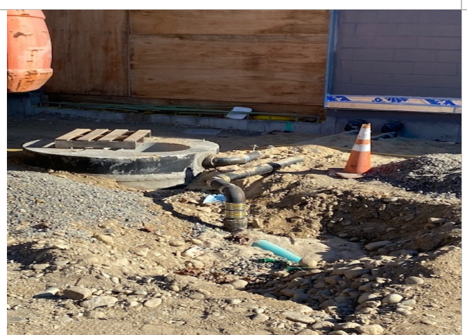
Piping installed at Oil/Water Separator at Sallyport