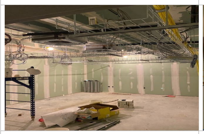
Wire trays installed at IT Server Room