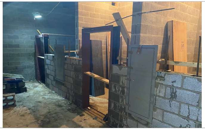
CMU construction and frame install at Men's Cells