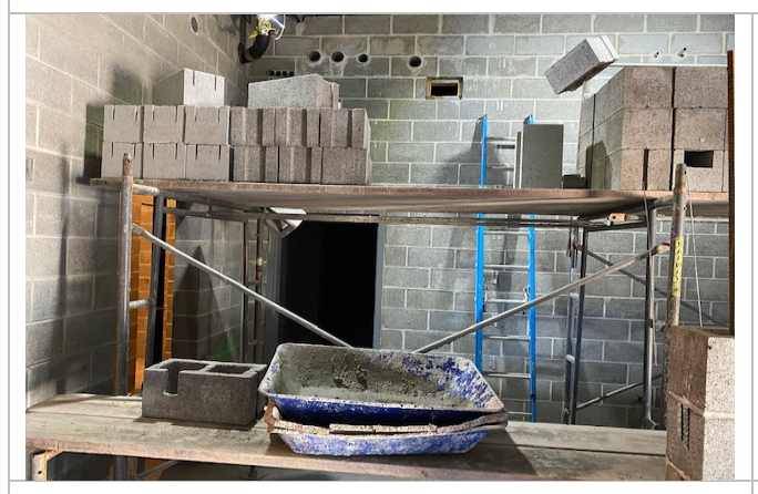
CMU Construction at exterior of Female Cells