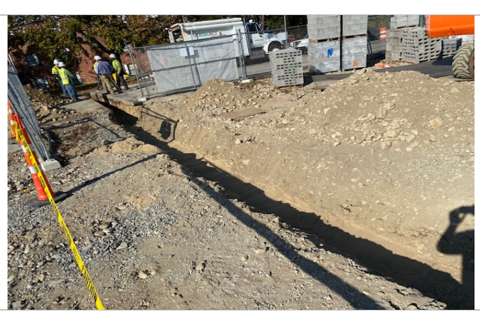
Trenching for Gas and Sewer from Parsonage Street