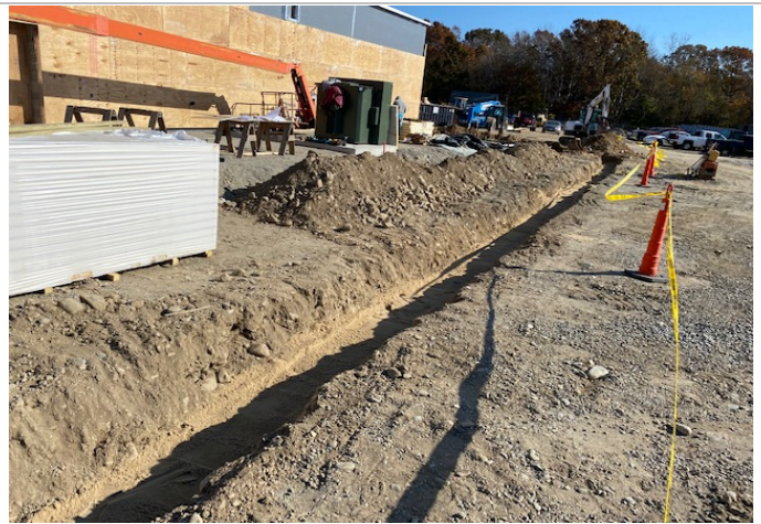
Trenching for Sewer Line for Auxiliary Building