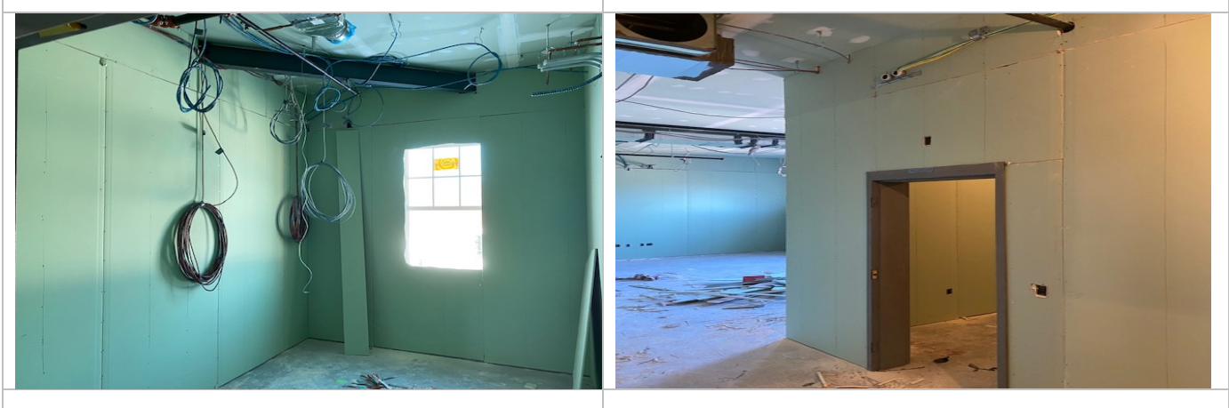
Drywall installed at Lieutenant's Office