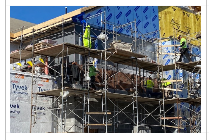
Exterior Brick install at rear of building