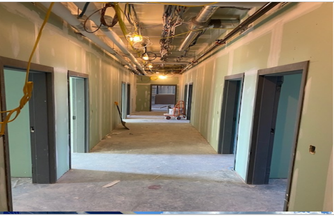
Hallway at Lieutenants' Offices