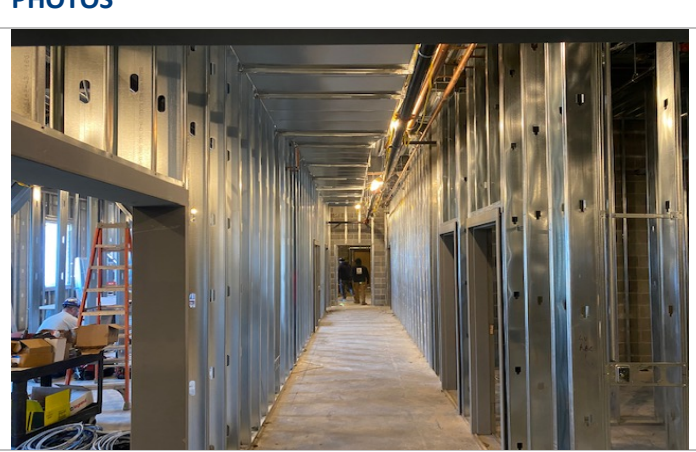
Hallway framed at Roll Call/NSO Office