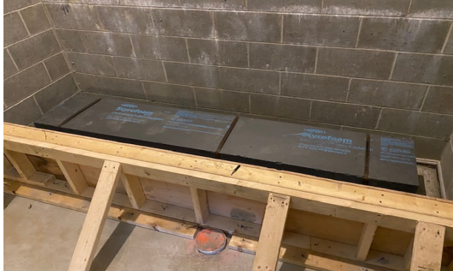
Detention Bunks formed