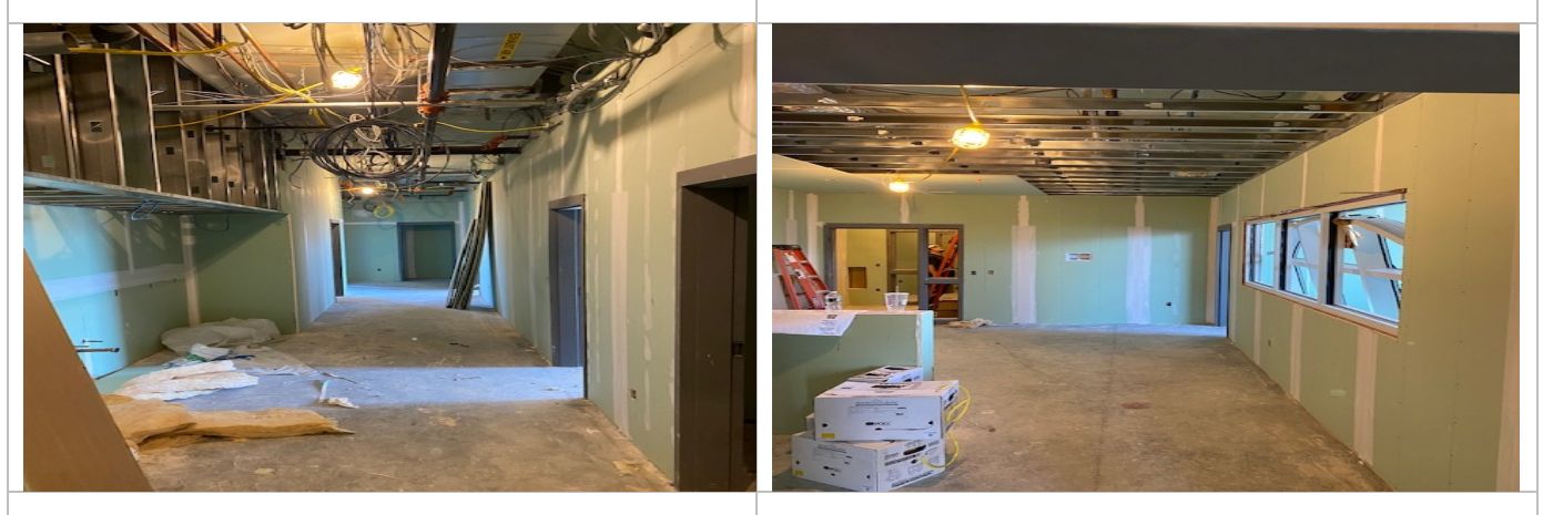
Hallway at Chief and Captain's Offices