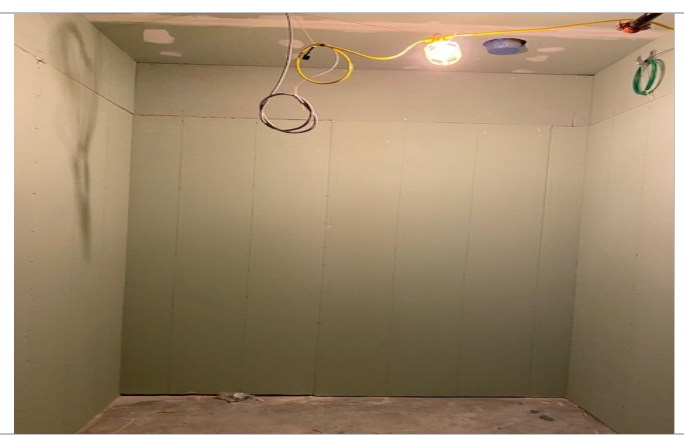
Interview Room Drywall Comlete