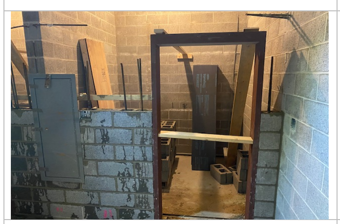
Detention Cell Frames installed