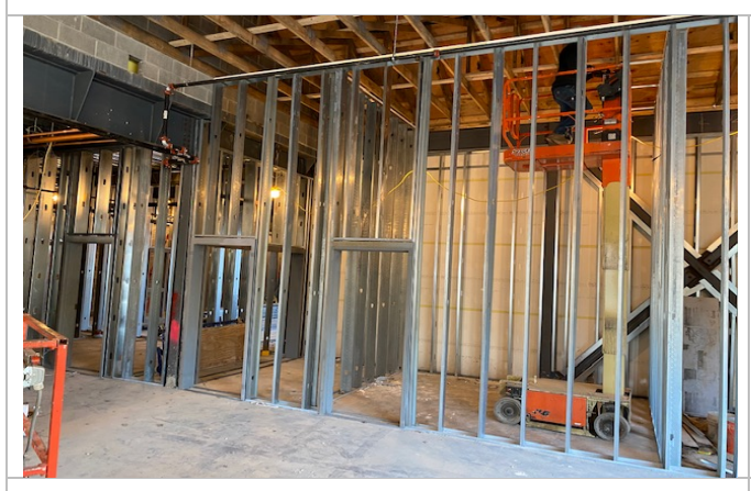
CATV Room framed at Training/EOC