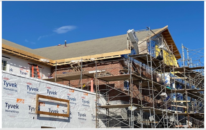
Exterior Brick install at rear of building further in progress