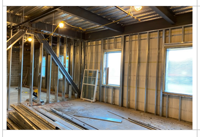
Inside Patrol Room