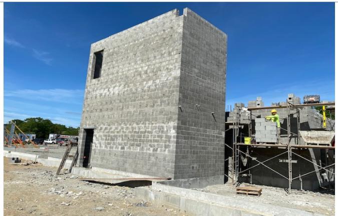
Stairway 12 completed