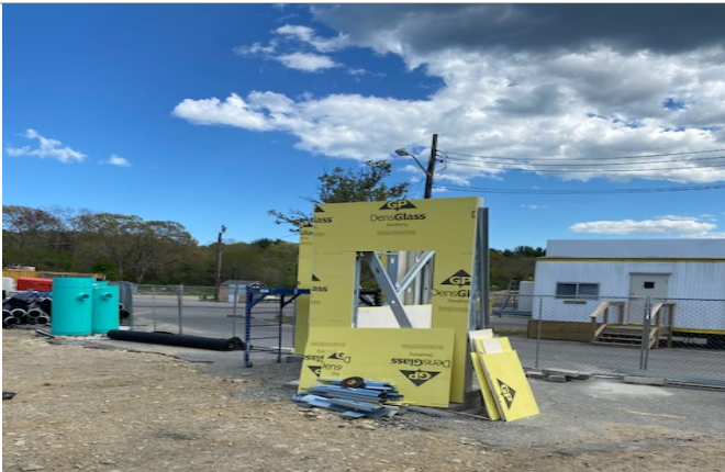
Installation of Metal Frame and Dens-Glass at Masonry Mockup