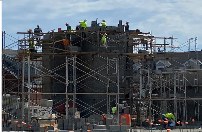
Overview of CMU work at Stairway 11 and Elevator