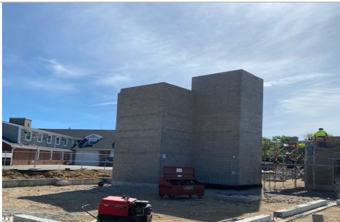
Stairway 11 and Elevator completed