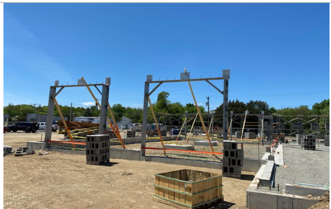
Sallyport Door Frame Installation Completed