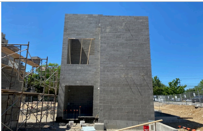
Elevator Shaft Completed