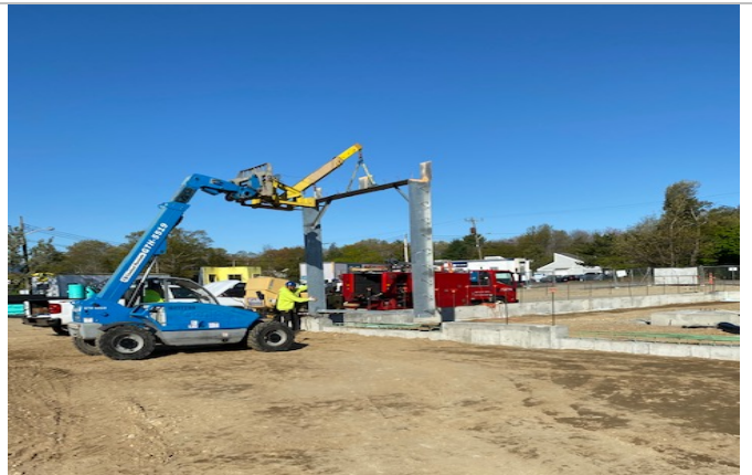
Installation of Sallyport Door Frame