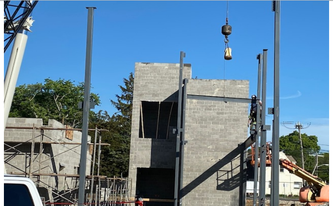
Beam being placed between Column Lines 14 & 16