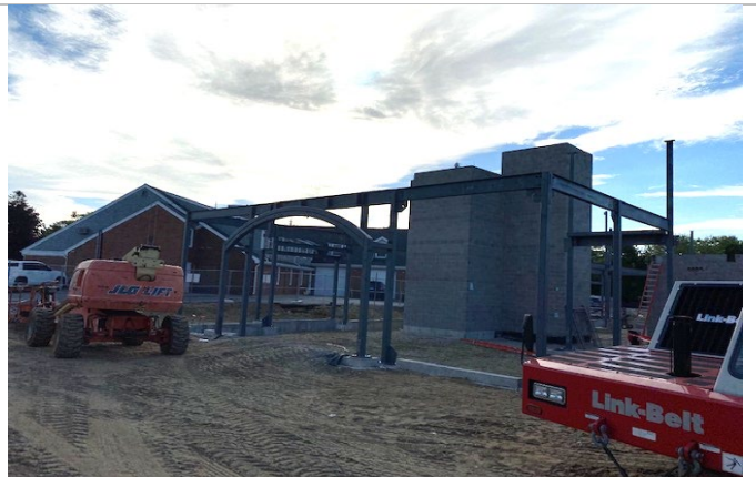
First Floor Steel Framing at new EOC