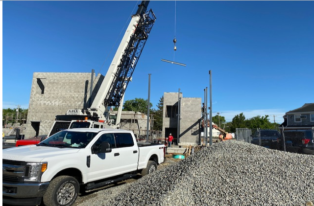
Steel Erection Begins at Column Lines 16 - 19