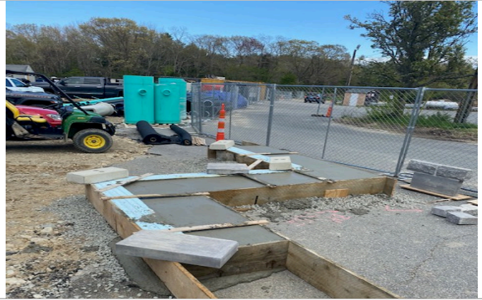
Forming of Foundation for Masonry Mockup