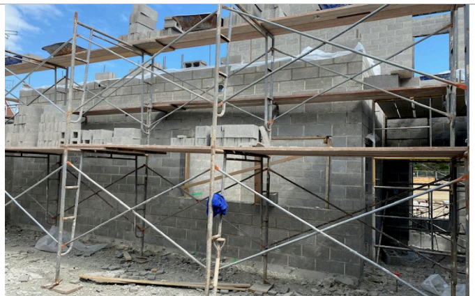
Inside view of CMU work in Dispatch Area