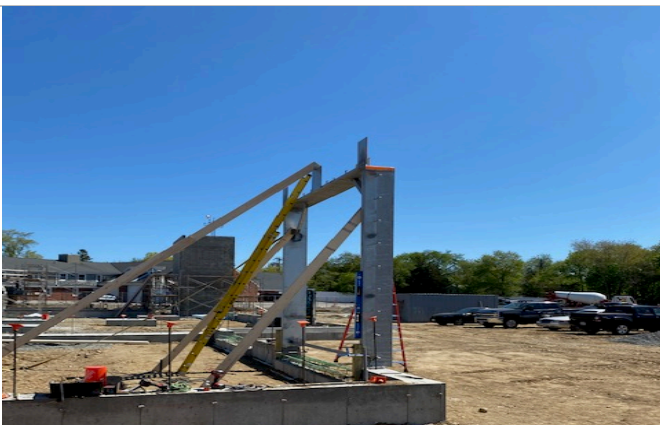
Bracing of Sallyport Door Frame