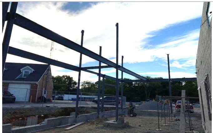
Column Lines 15 & 16 erected at Elevator Pit