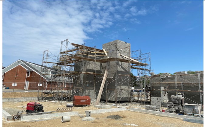
Stairway 11 and Elevator completed; Scaffolding being disassembled