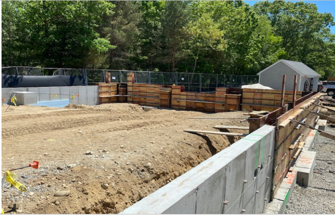
Forming of Foundation Walls at Auxiliary Building