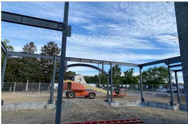
View from inside of EOC