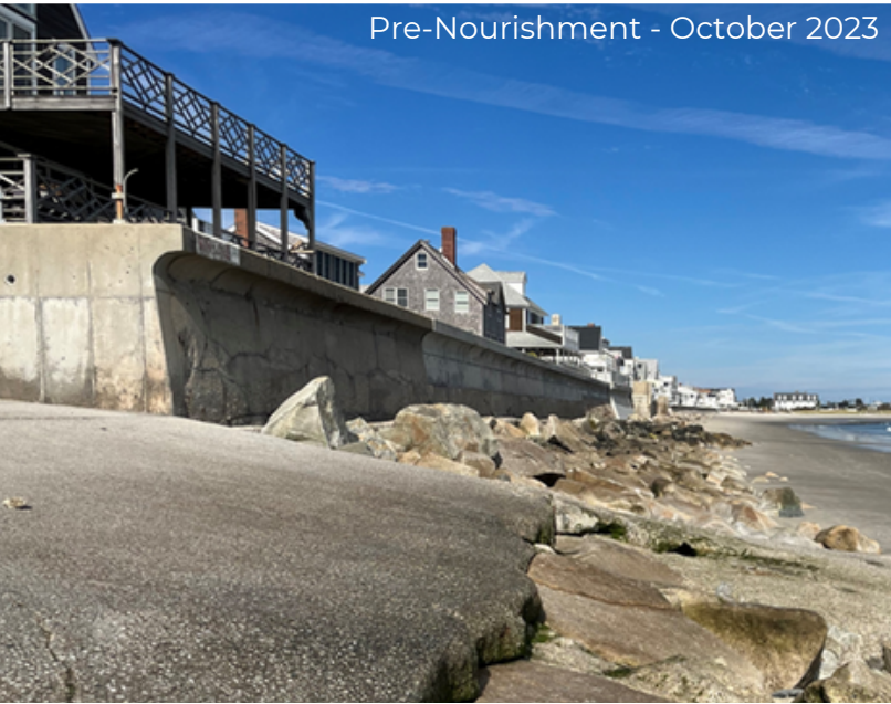
Pre-Nourishment - October 2023