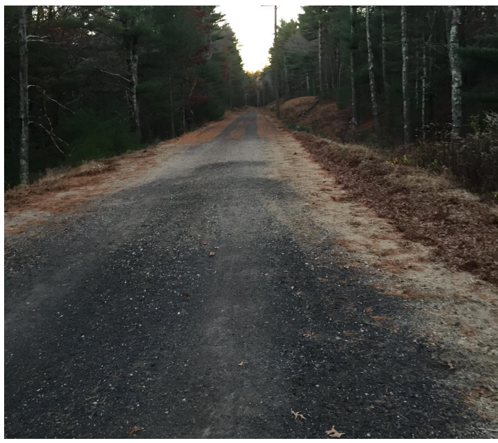
TRAIL SECTION WITH GRAVEL PAVEMENT.