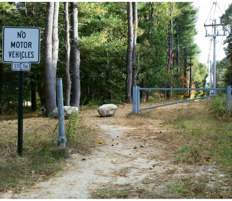
NORTHERN END OF BRIDLE TRAIL AT PINEHURST ROAD.

PARKING IS AVAILABLE AT THE TRAIL ENTRANCE ON SOUTH RIVER STREET NEXT TO THE SUBSTATION, DO NOT BLOCK THE SUBSTATION ACCESS. PARKING IS ALSO AVAILABLE FOR ROUGHLY 15 VEHICLES AT THE FERRY STREET ENTRANCE.