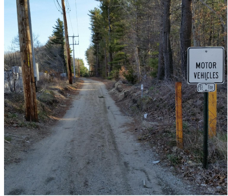
VIEW SOUTH AT CLAY PIT ROAD INTERSECTION.