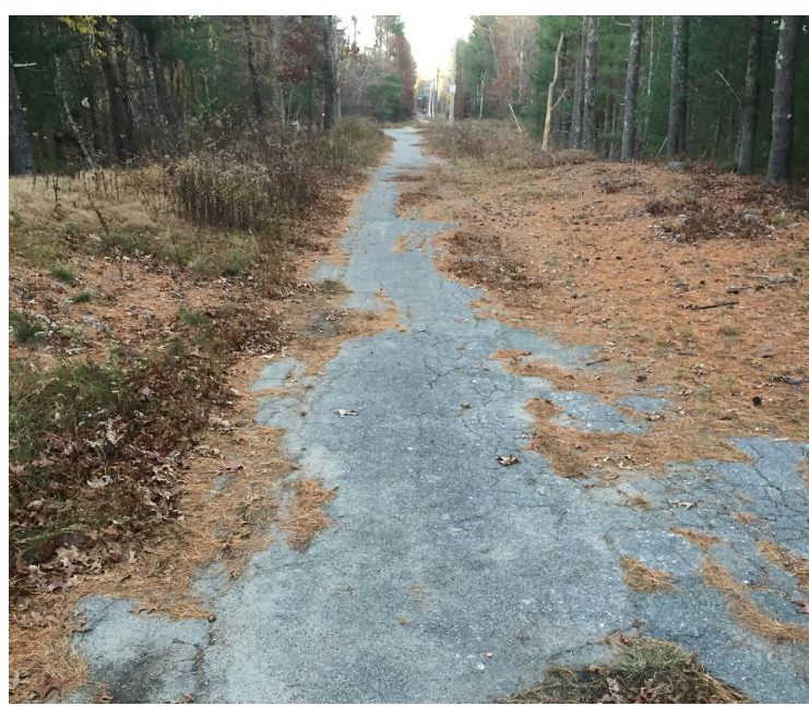
TRAIL SECTION WITH ASPHALT PAVEMENT.