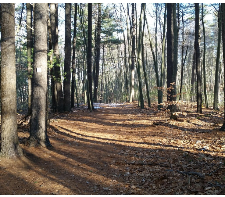
TYPICAL TRAIL VIEW, BROAD AND WELL MAINTAINED.

THERE IS A DEDICATED GRAVEL PARKING LOT AND UN-UTILIZED KIOSK OFF UNION STREET WITH SPACE FOR ABOUT 12 VEHICLES. PARKING IS ALSO AVAILABLE AT THE MARYLAND STREET CUL DE SAC.