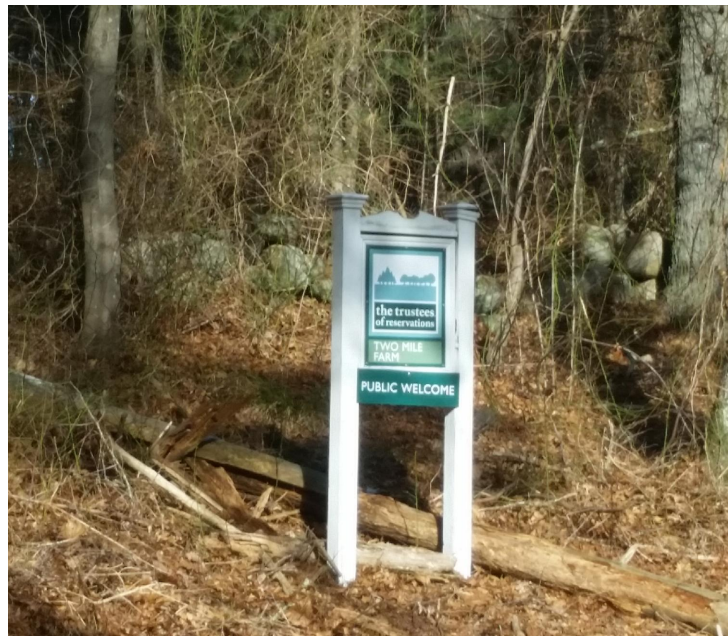
TWO MILE FARM TRAIL ENTRANCE SIGN.