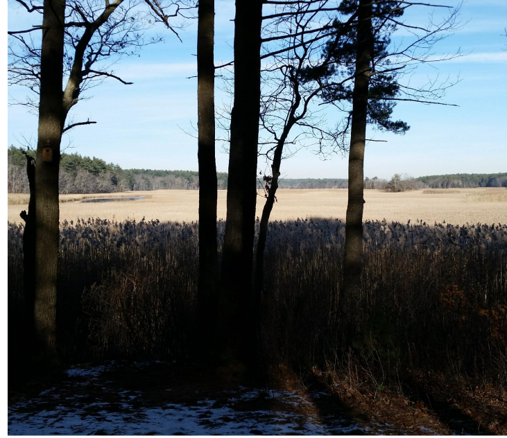
SCENIC OVERLOOK OF CONSERVATION LANDS.