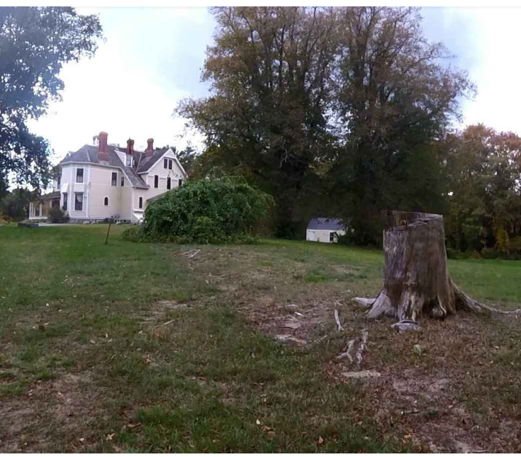
VIEW OF DANIEL WEBSTER'S HOUSE FROM TRAIL ACCESS.