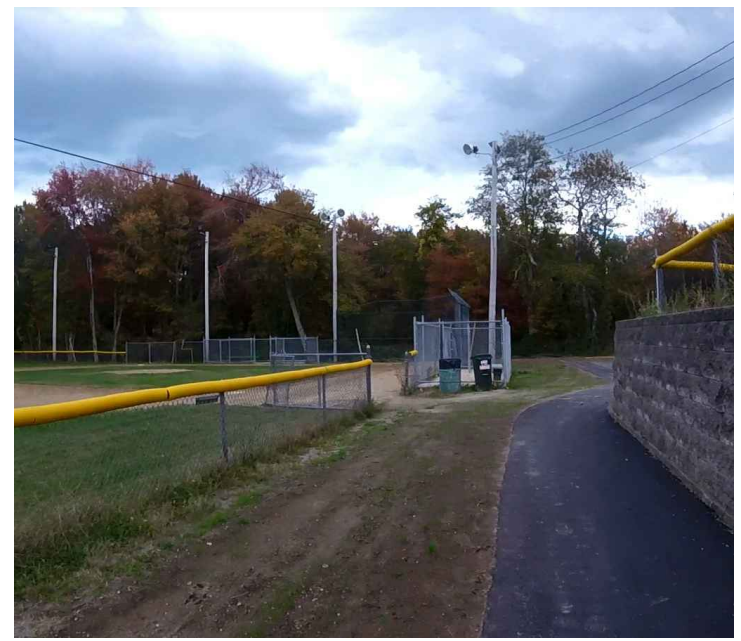
PATHWAY CONNECTING TRAIL AND WHEELER ATHLETIC FACILITY.