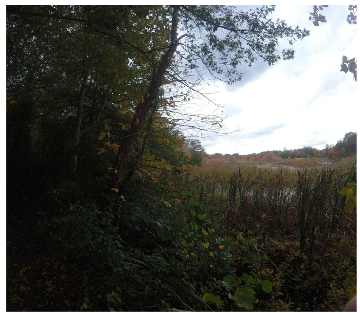
SCENIC VIEW OF POND.